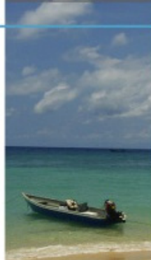
Environment and Energy