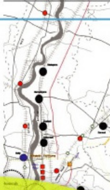
Urban and Regional Planning