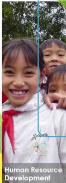
Human Resource Development