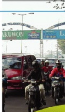
Transport and Traffic