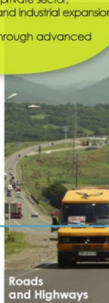
Roads and Highways