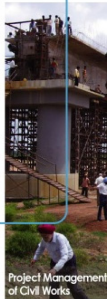
Project Management of Civil Works