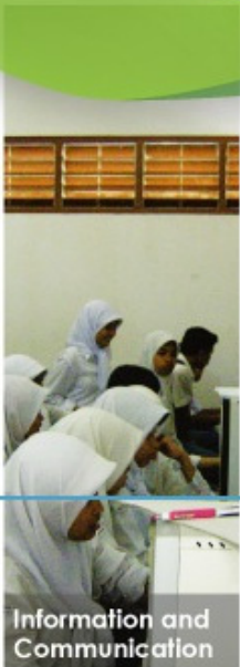
Information and Communication